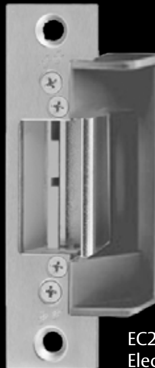
EC240 Series Electric Strike