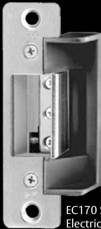
EC170 Series Electric Strike