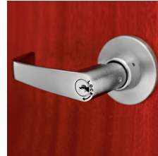
CL3300 Series Bored Lock

Scan the tag or visit the web site below for more information.