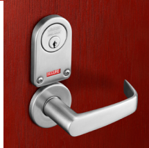
ML2000 Series Mortise Lock