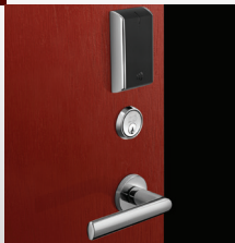
IN120 WiFi Access Control Lock